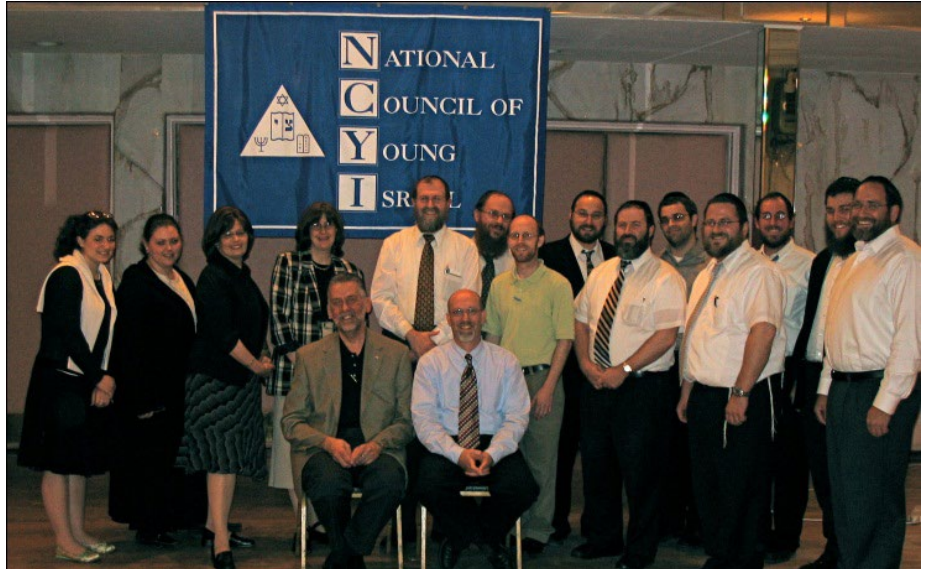
The first group to complete the Master of Arts in Educational Leadership program gathered for a group picture back in 2005.

Access to education can open up all kinds of doors. Bellevue University's partnership with Yeshiva Initiatives Educational Programs (YIEP) was designed to open doors for Orthodox Jews. The customized programs, administered through the University, allow Orthodox Jews to continue their education in an environment that does not conflict with their lifestyle demands and cultural customs.