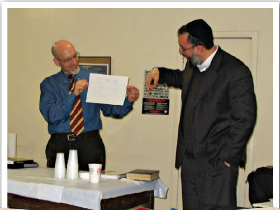
In an ironic twist, the professor became a student — of his own students' lifestyles

"His companion remarked, 'Mr. President, that was a very unselfish thing to do.' But the president replied, 'No, it wasn't really selfless. Because if I hadn't done it, I wouldn't be able to sleep tonight.'" Lincoln was able to recognize that altruism based on empathy is really, in the end, an attempt to make oneself feel better as much as it is an attempt to help another.